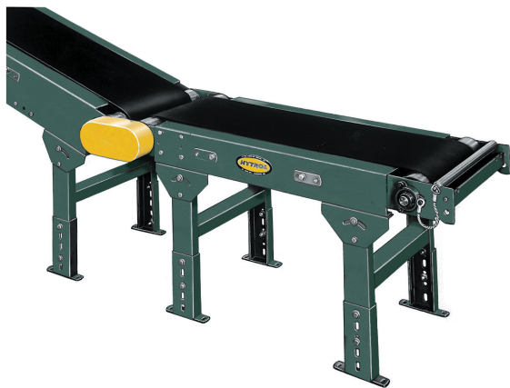
SHOWN WITH OPTIONAL LOWER POWERED FEEDER AND SUPPORTS

FLOOR SUPPORTS —Now supplied as optional equipment.