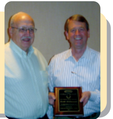
McKessock CEO receives award from Hytrol CEO, May 2007